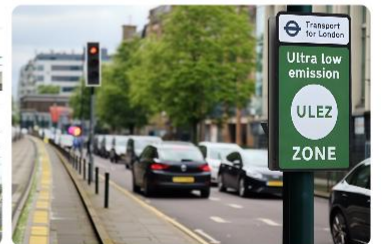
Low Emission Zone