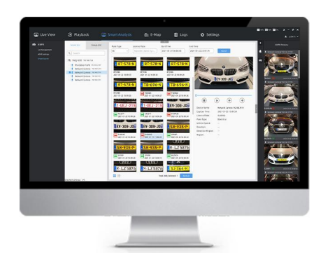
Support smart analysis like ANPR (black/white list detection and smart search)