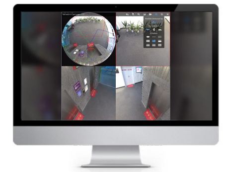
Support Fisheye Dewarping in both live view and playback